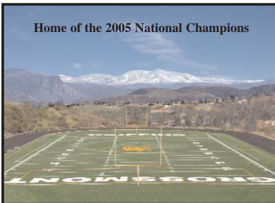
Home of the 2005 National Champions